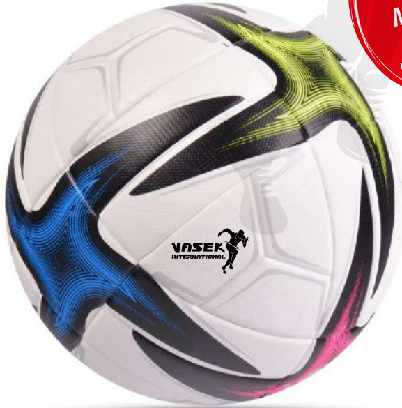
Art #: VI-SA-1103

SIZE COLOR MATERIAL MOQ ON CUSTOMER DEMAND