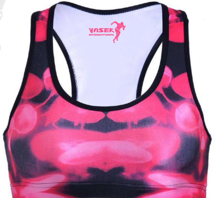
Art #: VI-FW-1502