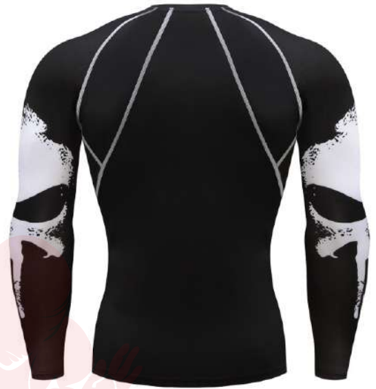
Art #: VI-FW-1101