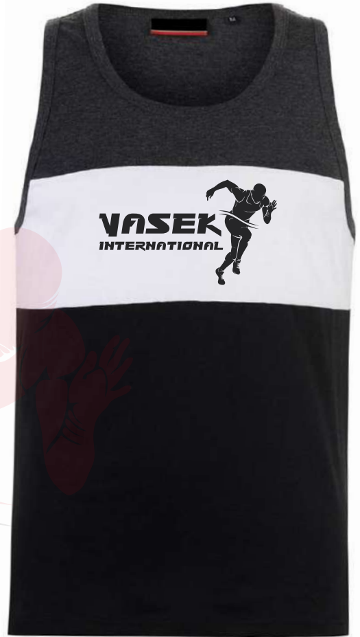
Art #: VI-FW-1403