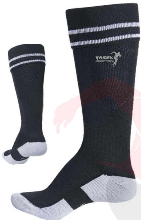
Art #: VI-CW-1801