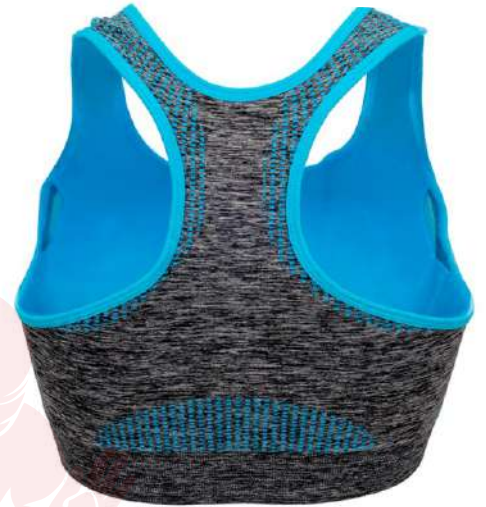
Art #: VI-FW-1501