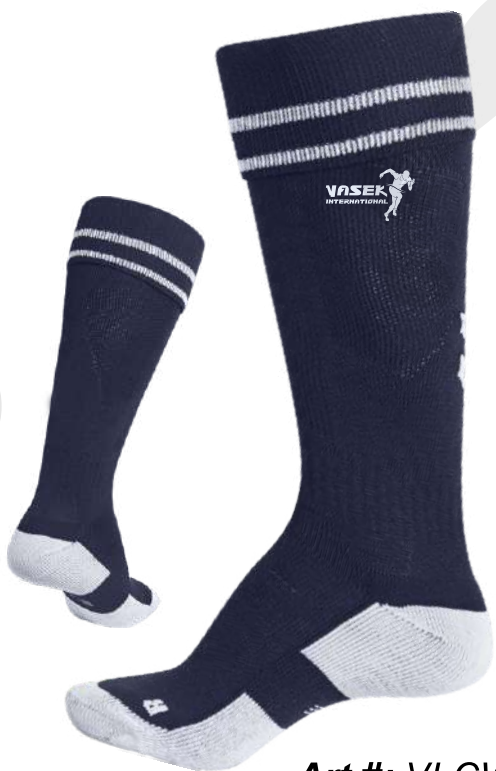
Art #: VI-CW-1803