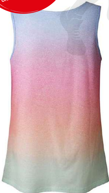
Art #: VI-FW-1402

SIKE COLOR MATERIAL MOQ ON CUSTOMER DEMAND