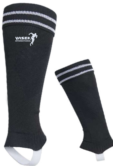
Art #: VI-CW-1804