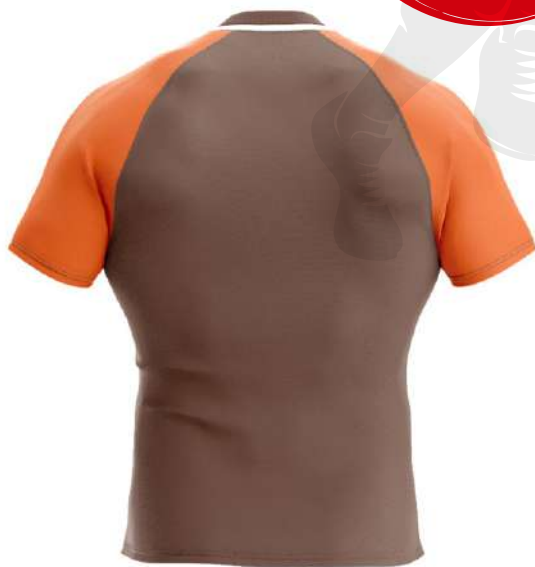
Art #: VI-FW-1102

SIKE COLOR MATERIAL MOQ ON CUSTOMER DEMAND