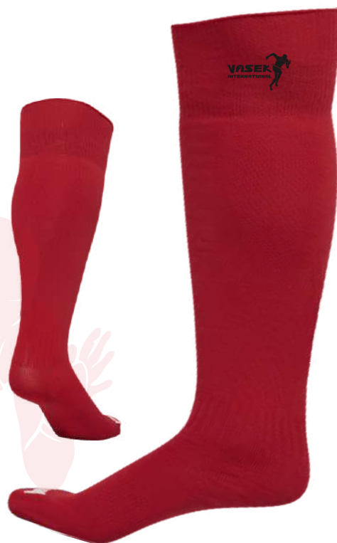
Art #: VI-CW-1802