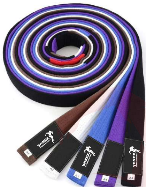
Art #: VI-MA-1301