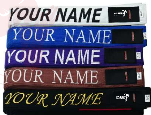
Art #: VI-MA-1302