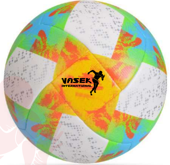
Art #: VI-TW-1102

Professional Football Soccer Ball Size 3 Size 4 Size 5 Red Green Goal Team Match Training Balls Machine Sewing