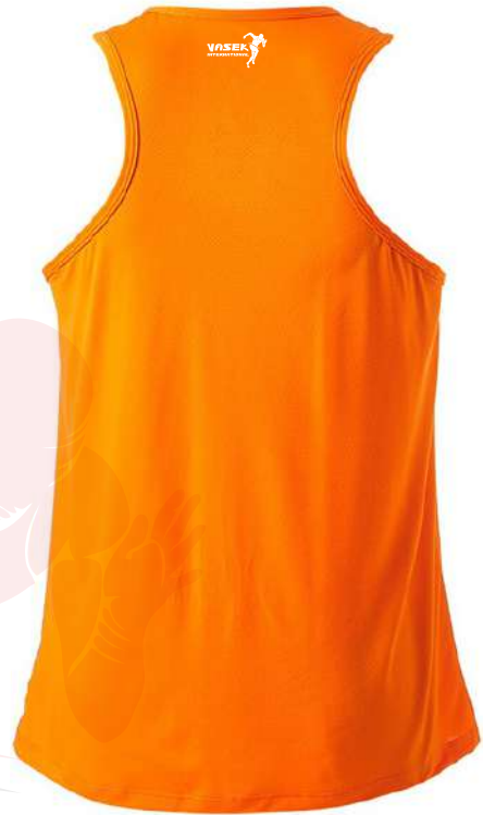
Art #: VI-FW-1401