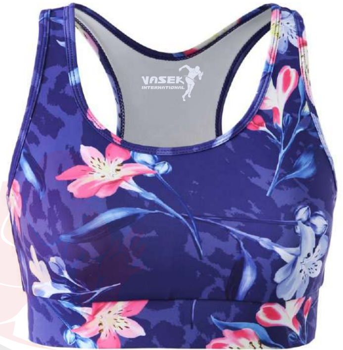
Art #: VI-FW-1503