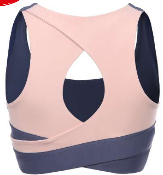
Art #: VI-FW-1504