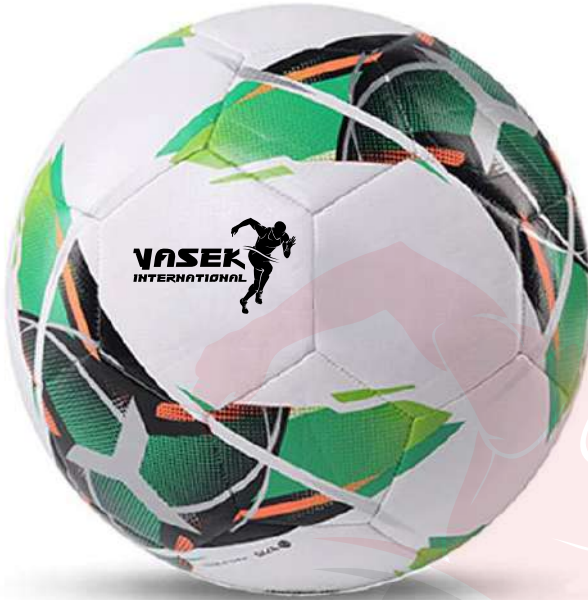
Art #: VI-TW-1101