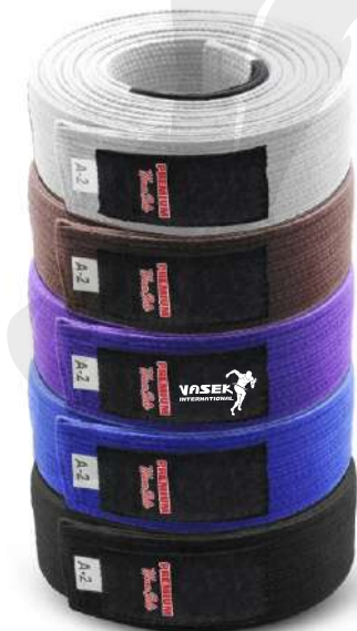
Art #: VI-MA-1303

SIZE COLOR MATERIAL MOQ ON CUSTOMER DEMAND