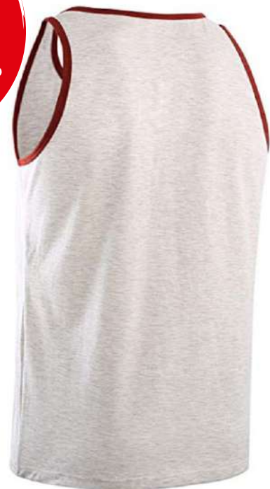
Art #: VI-FW-1404

SIKE COLOR MATERIAL MOQ ON CUSTOMER DEMAND